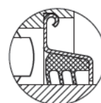
L 3 Triple-lip seal (Optional)